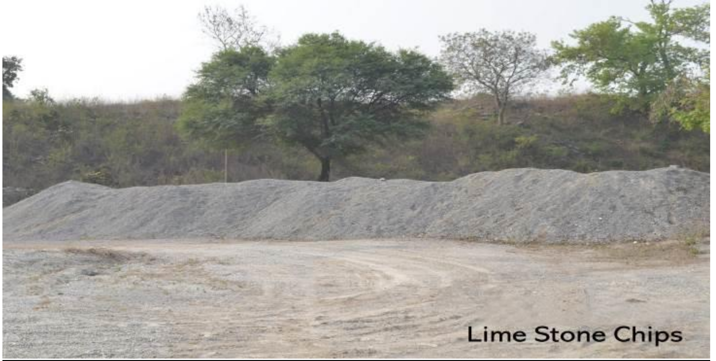
Lime Stone Chips